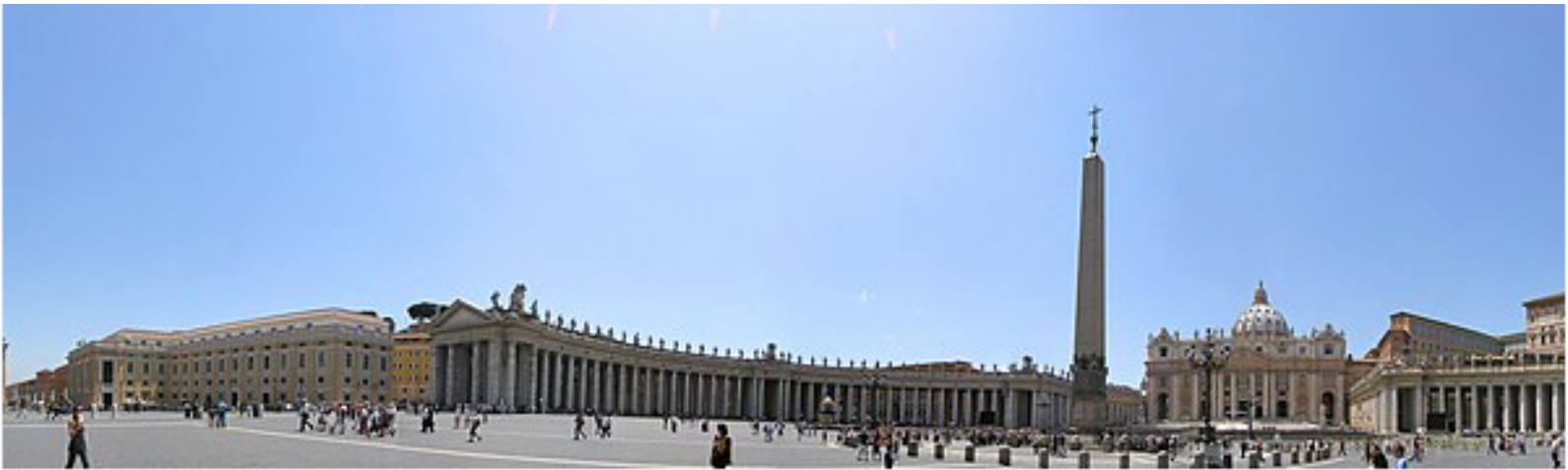
Panorama of St. Peter's Square