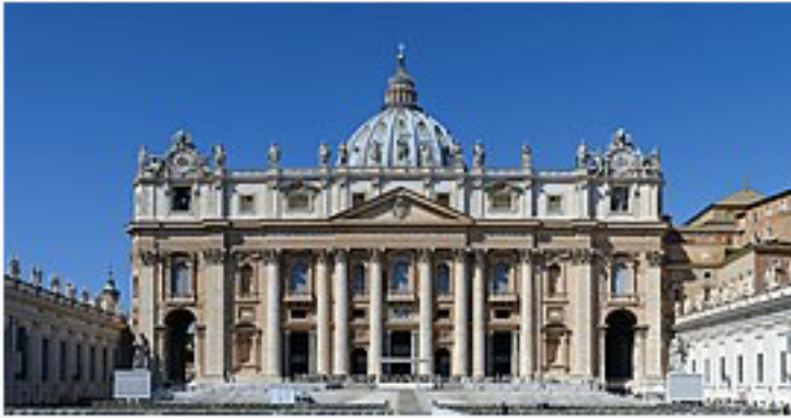
Main façade and dome of St. Peter's Basilica, seen from St. Peter's Square