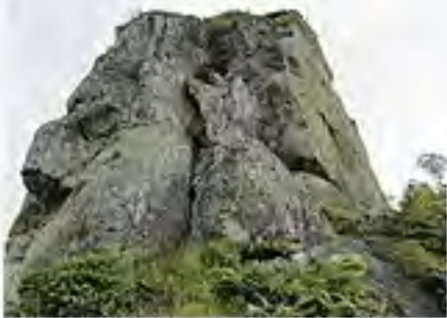
Te Rua Manga (The Needle)