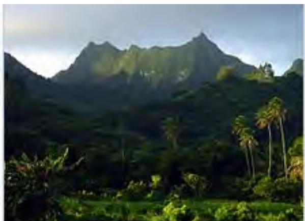
Te Manga is the highest mountain on Rarotonga and Cook Islands