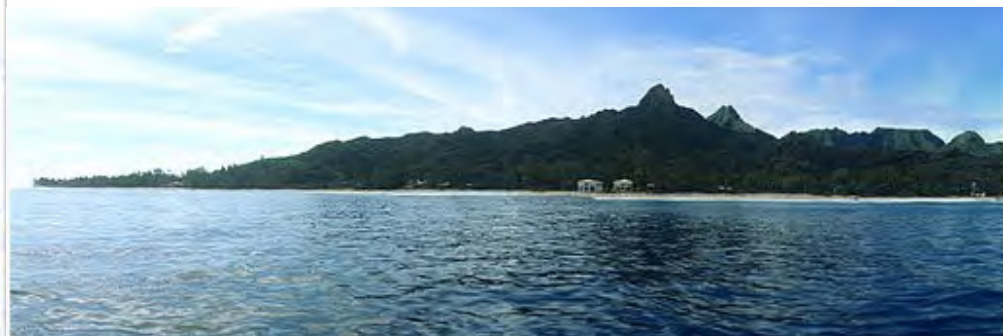
Rarotonga from the north