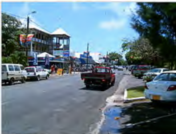
Avarua is the most populous centre on Rarotonga

Captain John Dibbs , master of the colonial brig Endeavour , is credited as the European discoverer on 25 July 1823, while transporting the missionary Reverend John Williams .