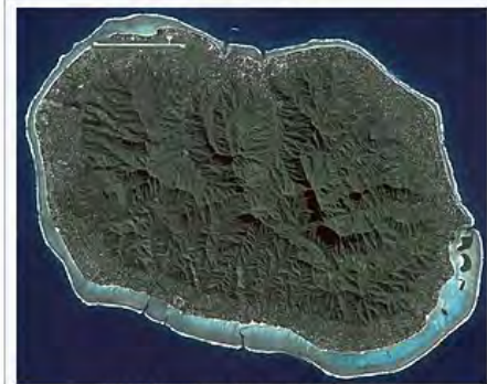
NASA satellite image of Rarotonga

Rarotonga is the largest and most populous of the Cook Islands . The island is volcanic, with an area of 67.39 km 2 (26.02 sq mi), and is home to almost 75% of the country's population, with 13,007 of a total population of 17,434. [1] The Cook Islands' Parliament buildings and international airport are on Rarotonga. Rarotonga is a very popular tourist destination with many resorts, hotels and motels. The chief town, Avarua , on the north coast, is the capital of the Cook Islands.