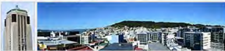
Clockwise from top: Oriental Bay and Te Aro along Wellington Harbour, The Beehive at Parliament, Newtown, Wellington Central and Mount Victoria, the Carillon, Cuba Street and its Bucket Fountain, Wellington Cable Car