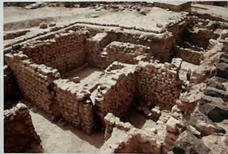
Resident Area (2010)