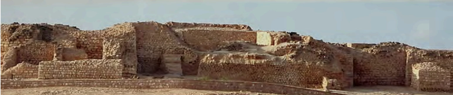
North side of the Archaeological site walls in 2010 الجهة الشمالية لأسوار الموقع الأثري عام ٢٠١٠م