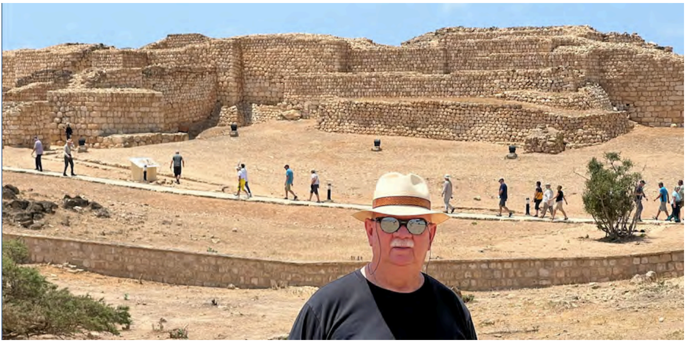
المنطقة السكنية (٢٠١٠م)