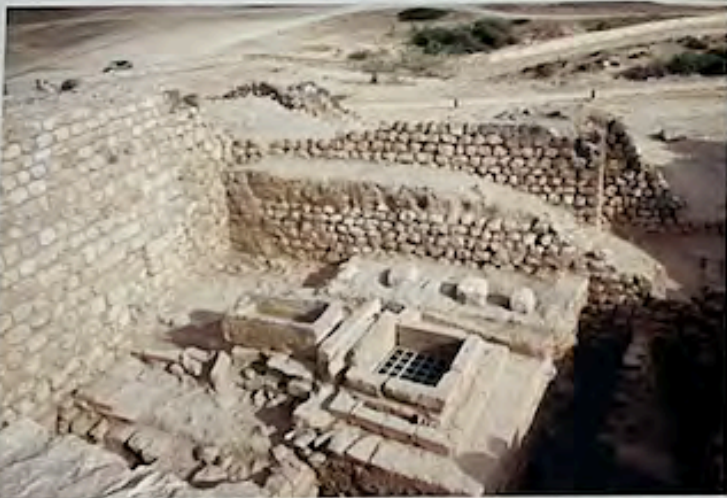
Monumental Building (2010)