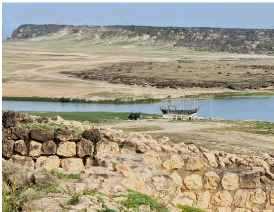
Khor Rouri (Palace of the Legendary Queen of Sheba)

Khawr Rawri or Khor Rori is a bar-built estuary at the mouth of Wadi Darbat in the Dhofar Governorate, Oman, near Taqah. It is a major breeding ground for birds, and used to act as an important harbour for frankincense trade when it was an open estuary. Wikipedia