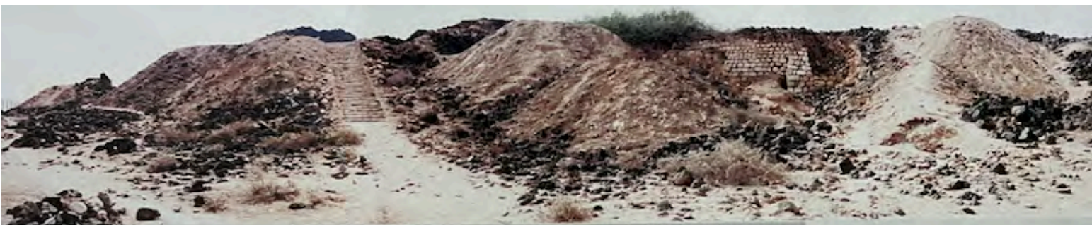
North side of the Archaeological site walls in 1997 الجهة الشمالية لأسوار الموقع الأثري عام ١٩٩٧م