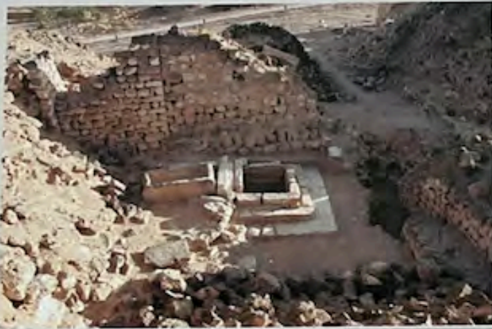
Monumental Building (2008)