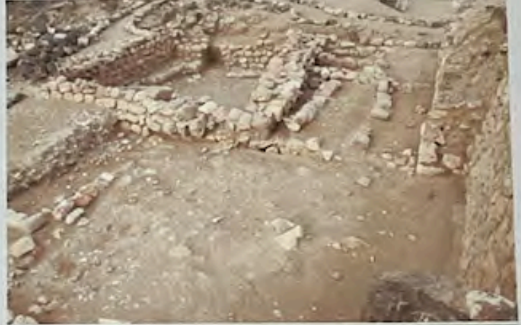
Resident Area (2008)