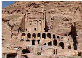
The Urn Tomb