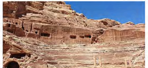
Roman Theatre Petra