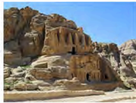
The Obelisk Tomb