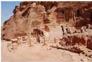
The Colored Triclinium