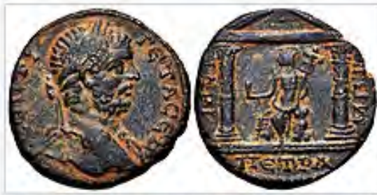
Roman bronze coin of Geta showing the Petra temple with statue of Tyche