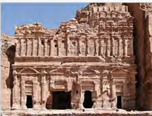
The Palace Tomb