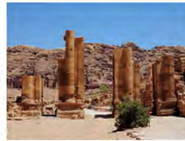
The Hadrian Gate also known as the Temenos Gate