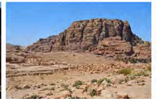
Petra Monastery Trail