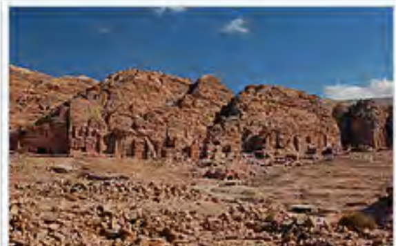
View of the Royal Tombs in Petra