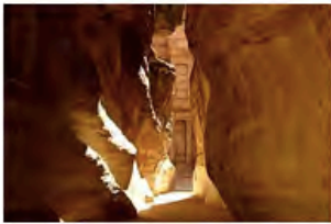
Siq, rays of light