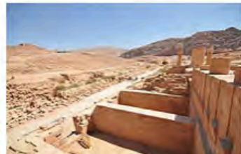
Petra Pool and Garden Complex