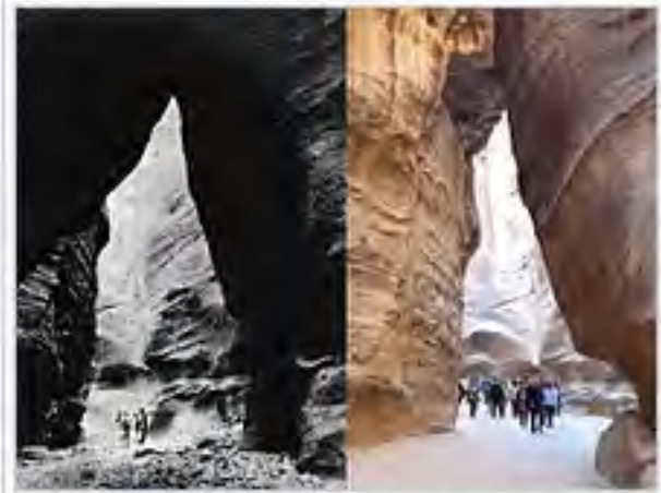
Petra Siq in 1947 (left) compared with the same location in 2013