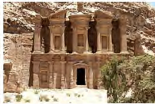
Ad Deir close-up