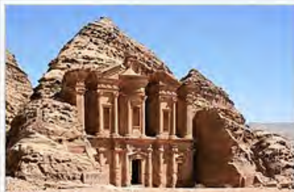
Ad Deir ("The Monastery")

Day 136 Page 3 April 25, 2023 Petra (Aqaba)