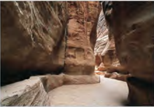
The narrow passage (Siq) that leads to Petra