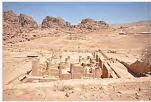
The Byzantine Church

Day 136 Page 2 April 25, 2023 Petra (Aqaba)