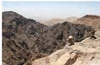
Cliffs near Petra, View over Wadi Arabah