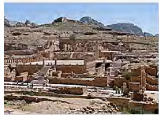
Great Temple of Petra