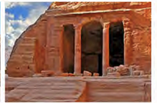
The Garden Temple