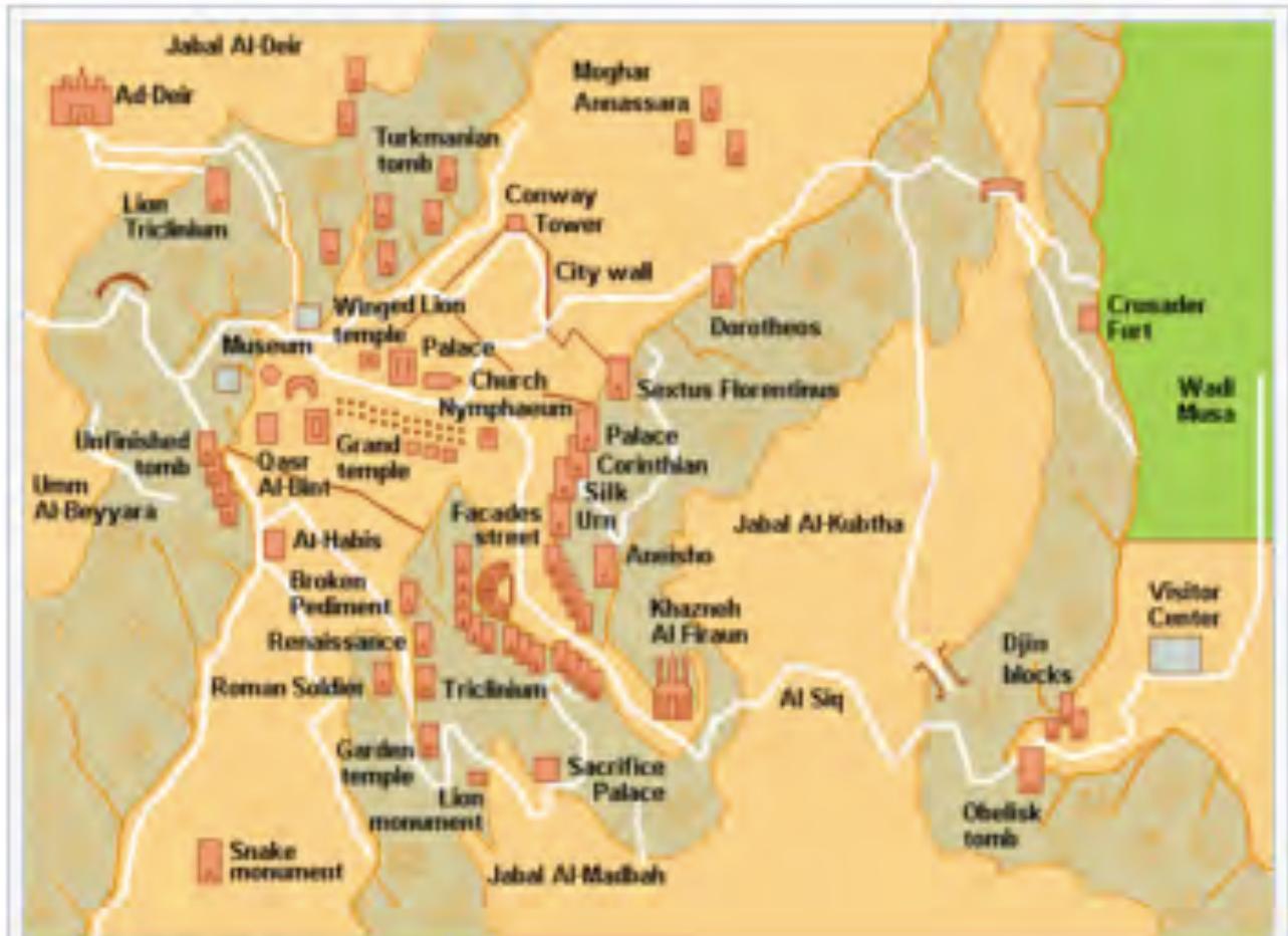
Map of Petra