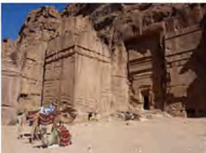
Street of Facades