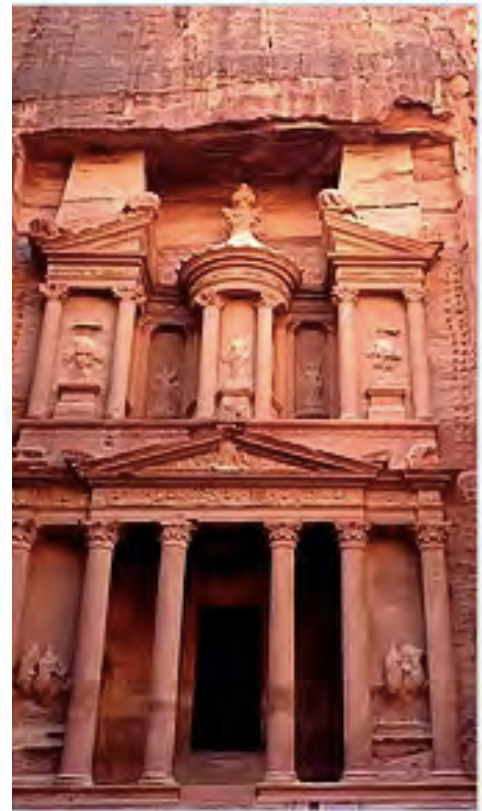
Al-Khazneh, the most popular tourist attraction