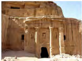
Tomb of the Roman Soldier