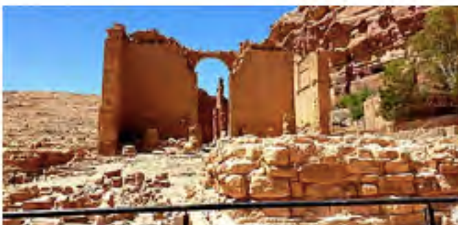
Temple of Dushares, Petra